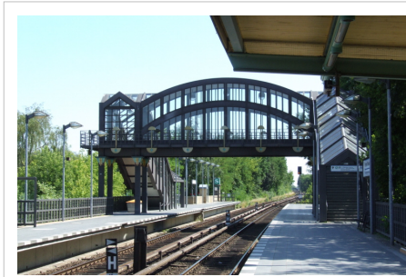
Übergang vom westlichen Bahnsteig zum Parkplatz

Am 15. Mai 1946 wurde in Berlin, wie von der amerikanischen Besatzungsmacht gefordert, der Haltepunkt Buckower Chaussee an der Dresdner Bahn östlich der Dorfaue Marienfelde eingerichtet. Dieser Haltepunkt blieb über viele Jahre ein Provisorium an der damals eingleisigen S-Bahn-Strecke. Erst mit dem zweigleisigen Ausbau zwischen Marienfelde und Lichtenrade Ende der 1980er Jahre erhielt die Station ihr charakteristisches Aussehen. Die beiden Seitenbahnsteige reichen nun bis zur namensgebenden Straße heran. Dort überspannt ein großer Torbogen die Bahnsteige und Gleise und macht auf den S-Bahnhof aufmerksam. Im Süden schließt eine Brücke den Bahnhof ab. Über diese Brücke ist der P+R-Platz ohne Querung